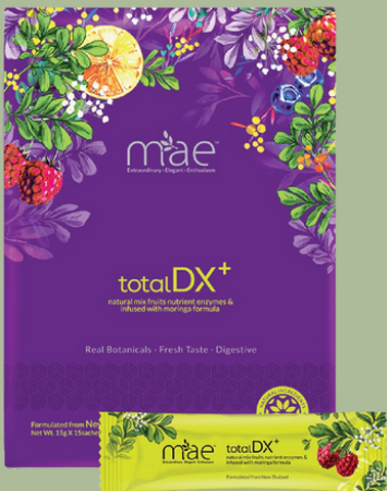
TOTAL DX +