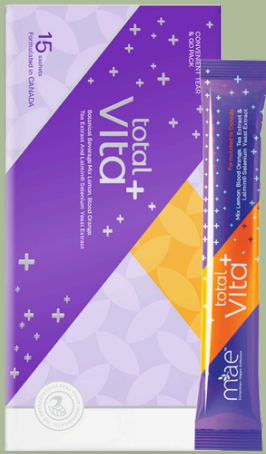
TOTAL VITA +