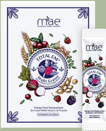
TOTAL EM +